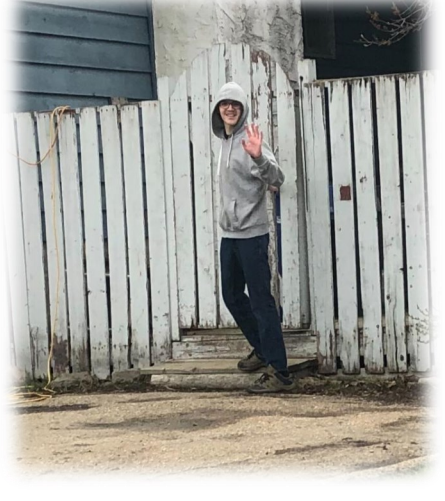
Staff were able to drive by and wish